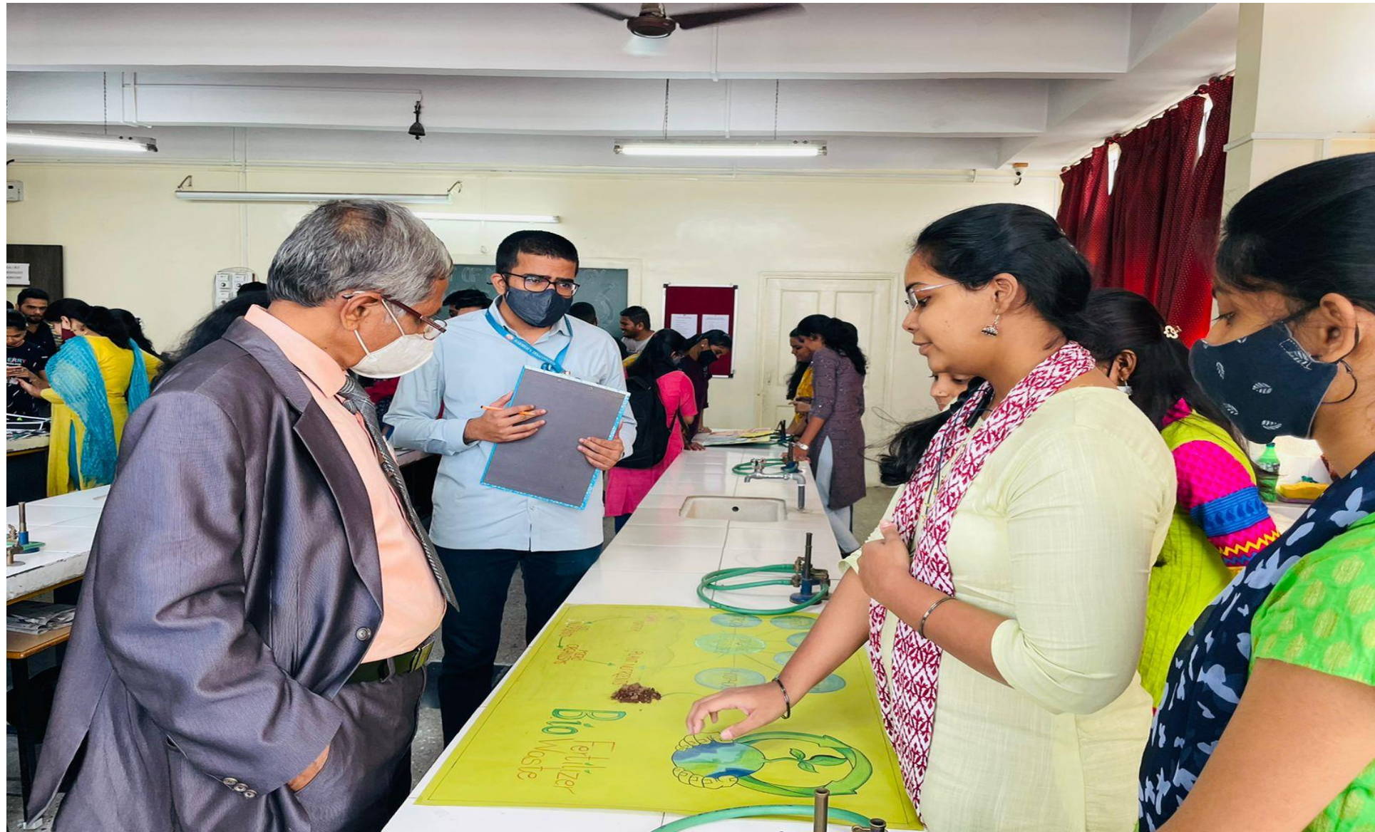
Discussion regarding Poster competition